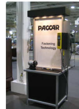
Tool Display Created for Paccar