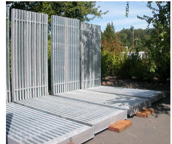
Anchorage Museum Transit Transfer Facility