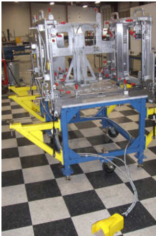
Manufacturing Fixture created by Waterjet Cutting and minimal machining